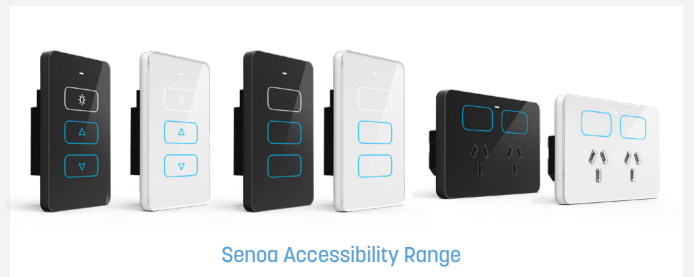
Senoa Accessibility Range