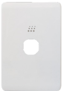
Example of PMPUSWV1GS With Leopard Skin (Cover)